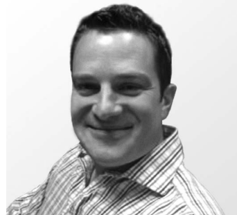
Founder, Axis Spine Technologies

'Ask yourself: what have we learned from the first wave that will better prepare the business for a repeat event?'