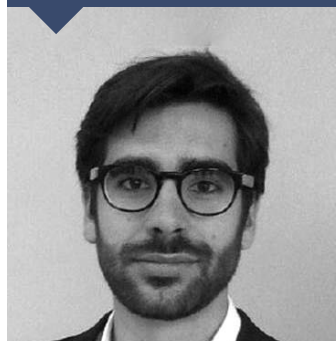
Founder & CEO, Microfluid X

'Reach out to investors locally and abroad, at least initially, to establish contact and gauge initial interest.'