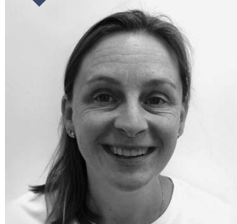
Co-Founder, ANB Sensors

'Finding ways to build a good relationship with the investors is key.'