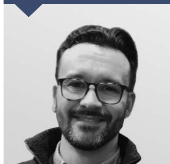
Co-Founder, Luffy AI

'Think about whether Covid will slow down your customer pipeline and if you need extra cash reserves.'